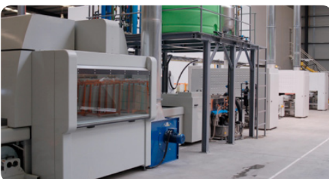
< Vindico PV+™ line in Portugal

Field test since April 2009: N 40 42' 51" W 8 12' 41" low soiling properties, not cleaned since installation >