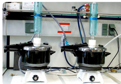
Boiling test, 10min. boiling in demineralized water at 100°C

Application line Vindico PV+™ anti reflection SiO2 and top sealing low-soiling™ Line of 43 meters, automatically application, capacity of 2,6 million m 2 per year of PV module glass sizes.