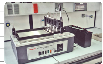
abrasion test equipment